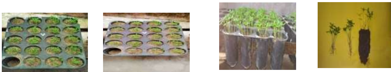
Figure-(1&2) showing seed germination improvement in diff Figure- (3&4) showing growth of 30 days old seedlings and showing length of root and shoot.