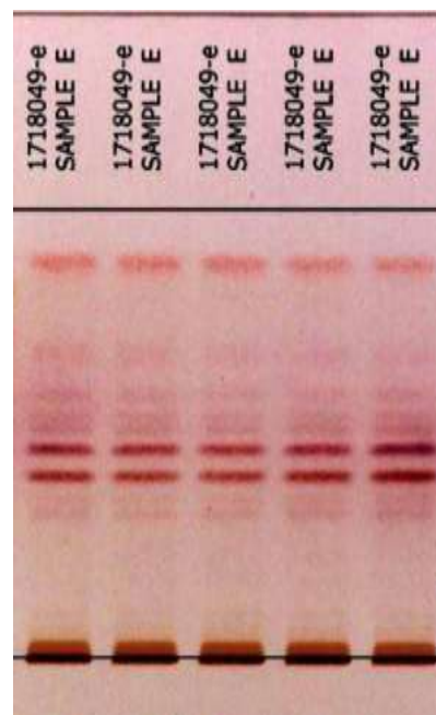
540 nm (after derivatization)