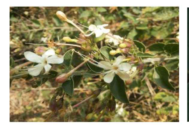
Clerodendrum phlomidis Linn.