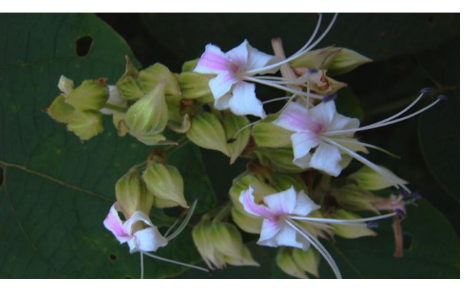
Clerodendrum infortunatum Linn.