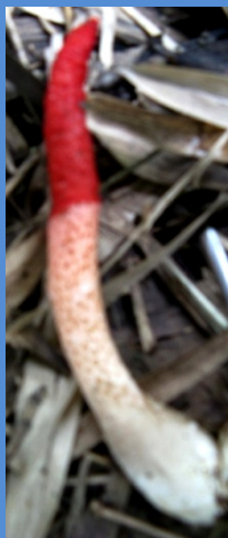
11: Mutinus canin