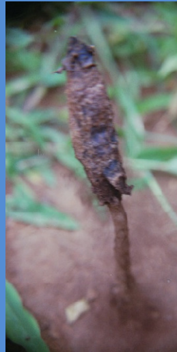
26: Podaxis pistillaris