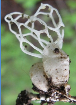
6: Ileodictyon sp.