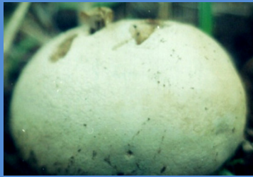
8: Lycoperdon sp.