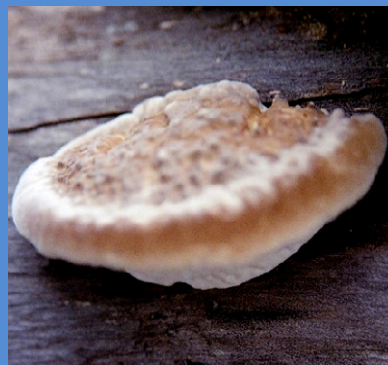
17: Pycnoporus sp.