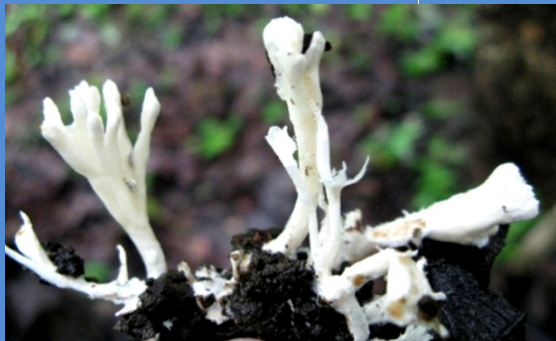
19: Clavulina cristata