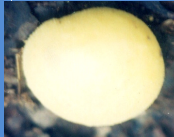
9: Lycoperdon sp.