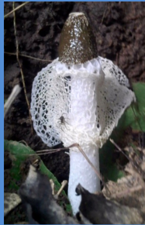
3: Phallus indusiata