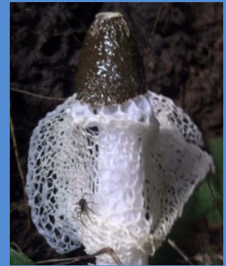
3': Phallus indusiata