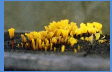
10: Dacryopinax spathularia