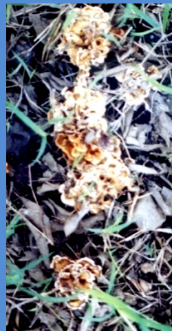
12: Sparassis crispa