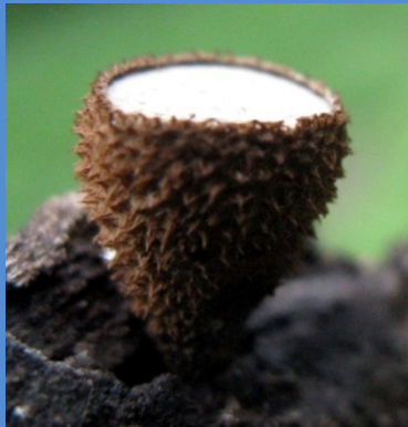
4: Cyathus striatus