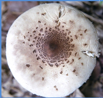
25: Lapiota Cristata