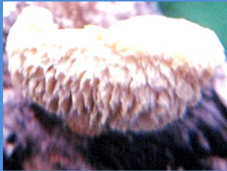
14': Hericium sp.