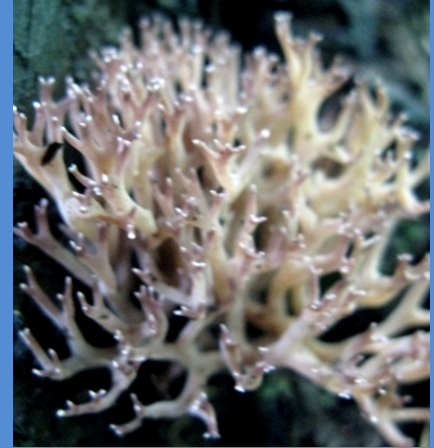
7: Clavaria sp.