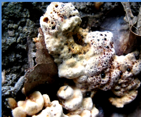
16: Hydnellum peckii