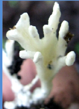
20: Clavulina rugosa