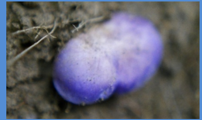
24: Cortinarius sp.