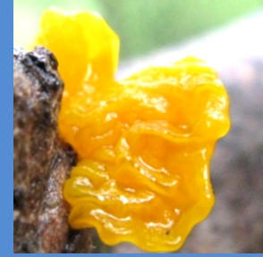
C: Tremella mesenterica