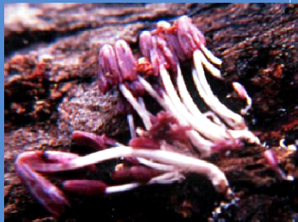
28: Gastrocybe sp.