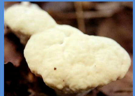
18: Pycnoporus sp.