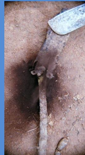
27: Podaxis pistillaris