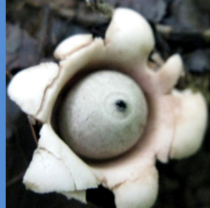
B: Geastrum fimbriatum