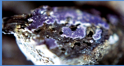
23: Pulcherricium caeruleum