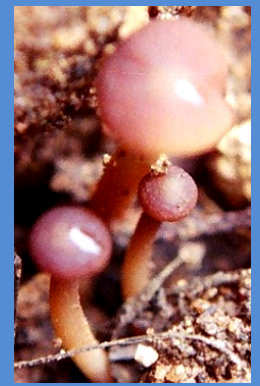
31: Hygrocybe sp.