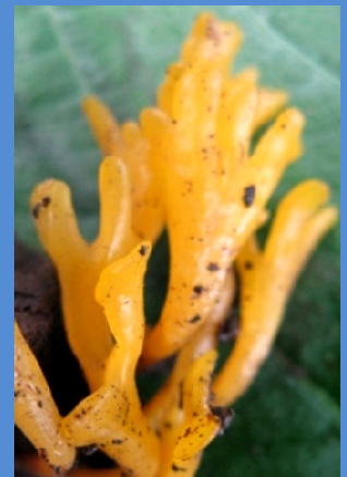
13: Calocera sp.