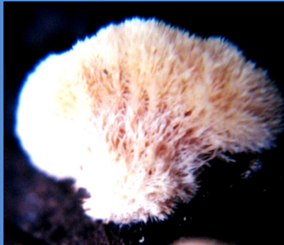
14: Hericium sp.