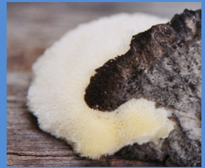
15: Hericium sp.