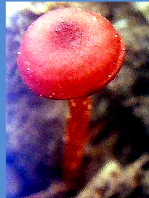
30: Hygrocybe coccinea