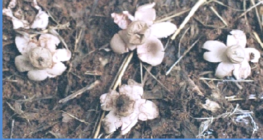
A: Geastrum fimbriatum