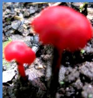
29: Hygrocybe coccineocrenata