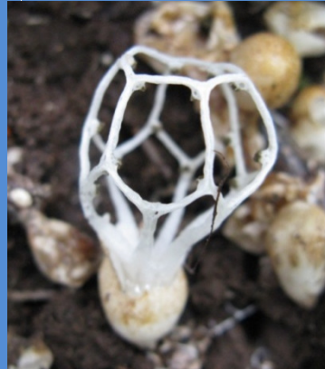
6': Ileodictyon sp.