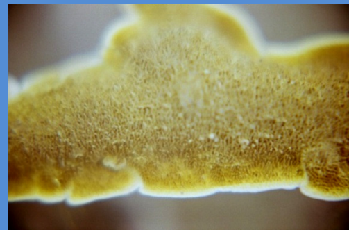
5: : unknown