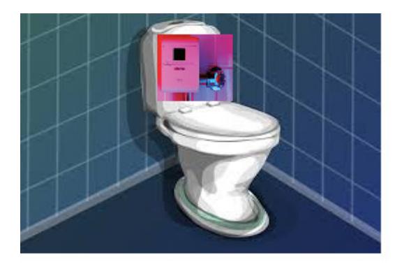
Figure 2: Installation of Automatic Flush system