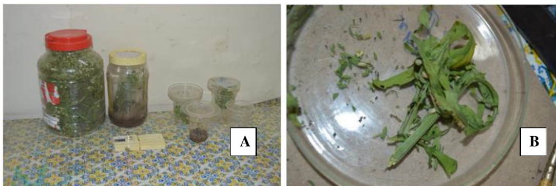
Fig. 1 (A-B): Rearing of beetles Z. bicolorata in laboratory

Temperature and 65±5% Relative Humidity in Biotechniques B.O.D. incubator. The wilted leaves were replaced daily with fresh ones. Newly hatched larvae were reared in petri-plates and when fully grown were transferred to plastic jars filled with moist sand, for pupation. Freshly emerged adults from the stock culture were isolated for use in experiments.