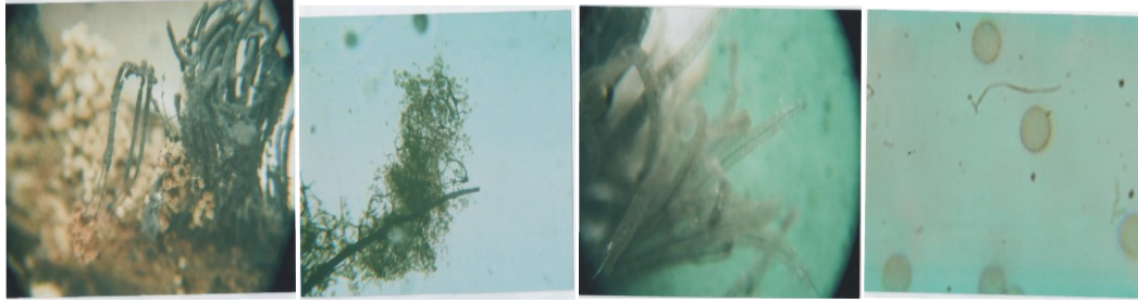
3. Stemonitis mussooriensis