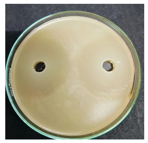
Fig 2. Zone of inhibition agar well diffusion method