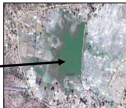
Satara Tukum lake view