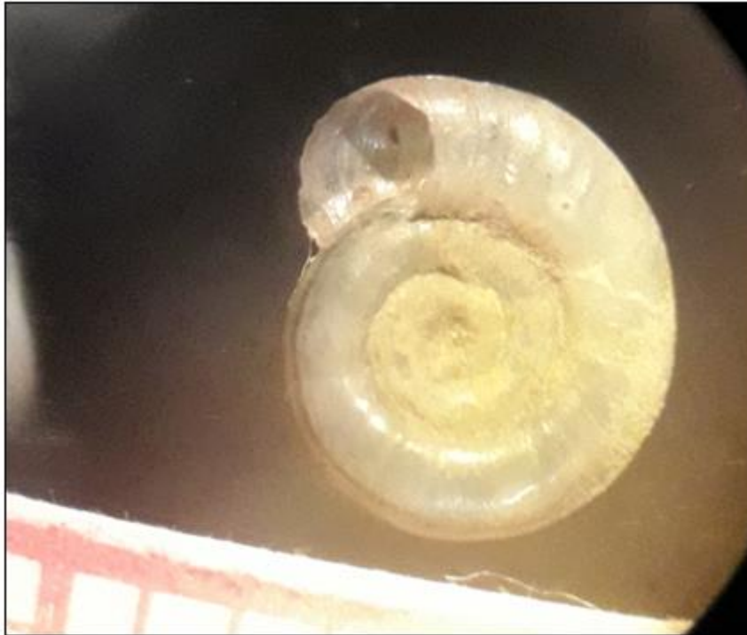
Fig:1. Apertural view of shell of a snail, Planorbis planorbis showing Characteristic brown line on shell.