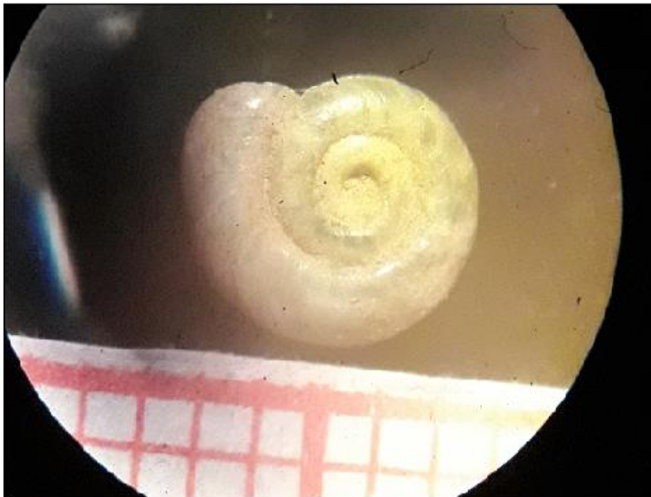
Fig:2. Umbilical side of shell showing spiral whorls, umbilicus.