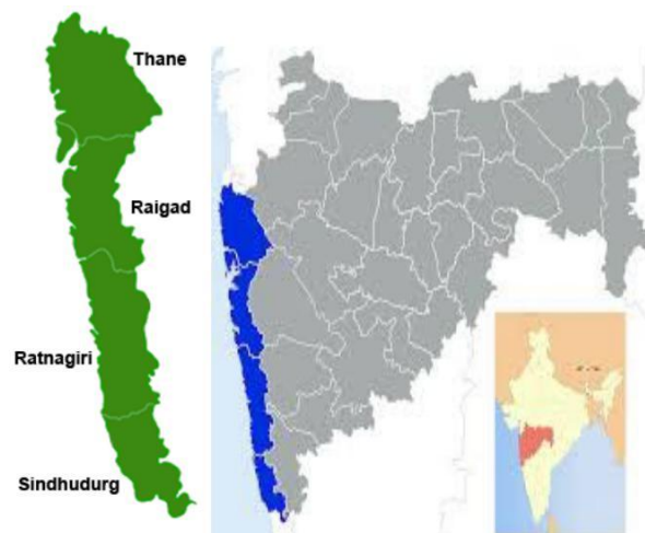
Figure 1:- Map of Konkan showing study area

Yesodharan, K. (2007). Wild edible plants traditionally used by the tribes in the Parambikulam wild life sanctuary Kerala, India. Natural Product Radiance Vol. 6(1) - pp 74-80.