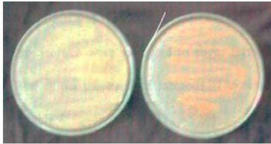
Figure. 2- Representative sample plates of Ut 1 and Ut 4