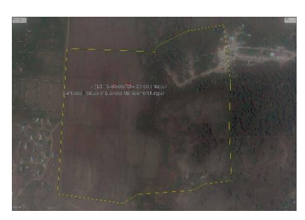
Fig a showing the details of analysis and area under change of march-2016.

Chen, H. and Pontius, Jr., R.G.2010.Diagnostic tools to evaluate a spatial land change projection along a gradient of an explanatory variable .Landscape Ecology, 22,1383-1393.