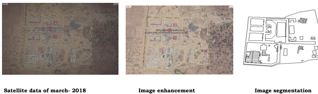
Fig a showing the details of analysis and area under change of march-2018.