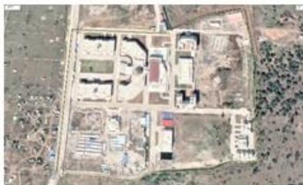
Image Thresholding May-2020