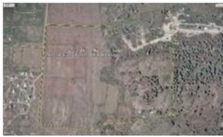
Image Thresholding March-2016