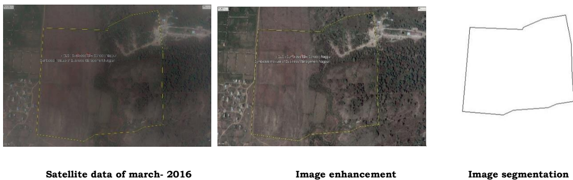
Fig a showing the details of analysis and area under change of march-2016.

Chen, H. and Pontius, Jr., R.G.2010.Diagnostic tools to evaluate a spatial land change projection along a gradient of an explanatory variable .Landscape Ecology, 22,1383-1393.