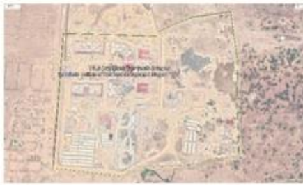
Image Thresholding March-2018