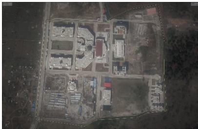
Satellite data of May- 2020