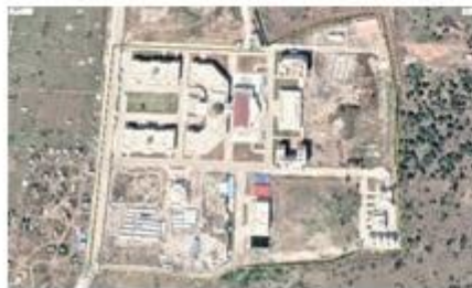
Image Thresholding May-2020