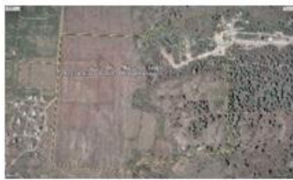
Image Thresholding March-2016