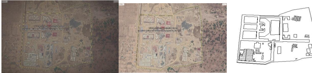
Fig a showing the details of analysis and area under change of march-2018.