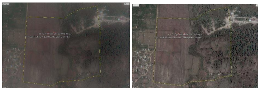
Fig a showing the details of analysis and area under change of march-2016.