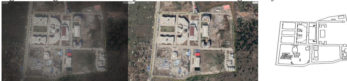
Fig a showing the details of analysis and area under change of May-2020.