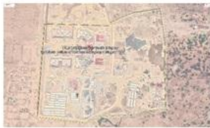
Image Thresholding March-2018