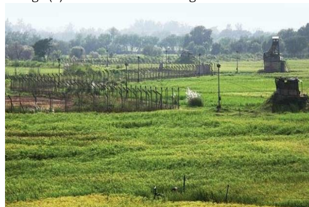
Image (c): Actual Image of the SOBRC at Indo-Pak Border in R.S. Pura