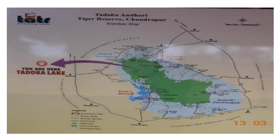
Figure 1: Tadoba Core Zone map.