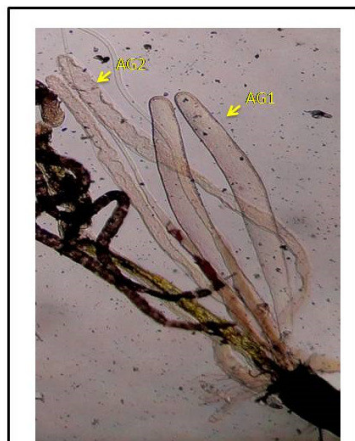
Fig 3 Accessory Glands of Elaphrothrips procer AG-Accessory Gland (AG1 and AG2)