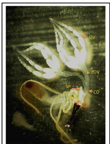
Fig 1. Female Reproductive Organ of Elaphrothrips procer OV-Ovarioles, LOV-Lateral Ovarioles CD-Common Oviduct, SP-Spermatheca