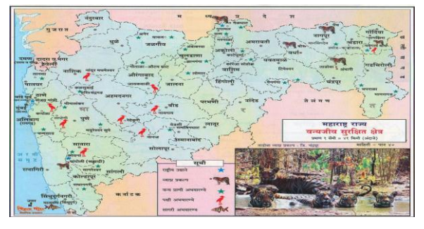
Maharashtra Wildlife Sanctuaries

Besides the tigers, you will also get to witness various other wild species like leopards, gaur, wild dogs, sloth bears, jungle cats, hyenas, sambar, cheetah, nilgai and barking deer. swampy crocodiles and migratory ducks around the Tadoba Lake. The Tadoba Lake is located at the center of the Tadoba-Andhari tiger reserve. hawk eagle, black-hooded oriole, monarch flycatcher, grey-hornbill and golden-oriole.